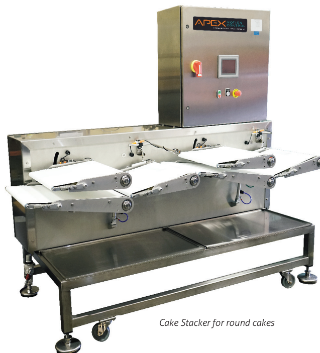
Cake Stacker for round cakes